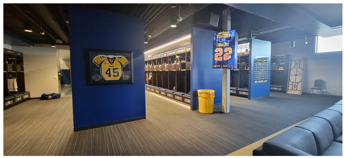
1. Picture of UCO men's football locker room